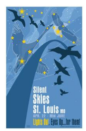
Silent Skies/Lights Out Program Poster