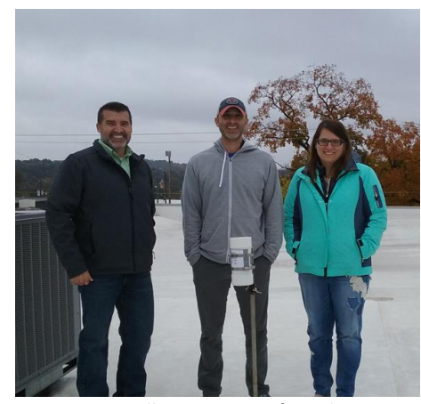
SQM Installation at City of Ozark, MO

Our chapter partnered with Truman State to expand the program across Missouri with thoughtful deployment across "operating zones" and attention to measuring sky brightness in both metro and rural areas. By October 2019, ten Sky-Quality Meters were deployed with plans to further expand the program.