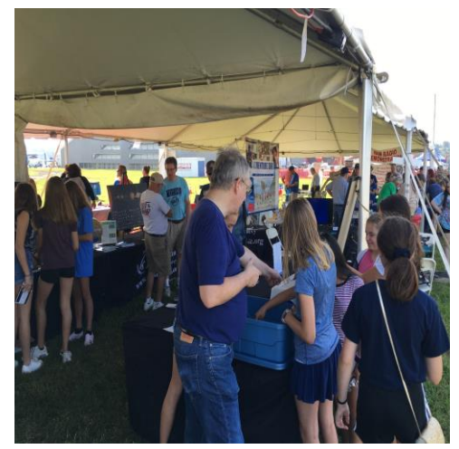
2019 Airshow. 1000+ attendees