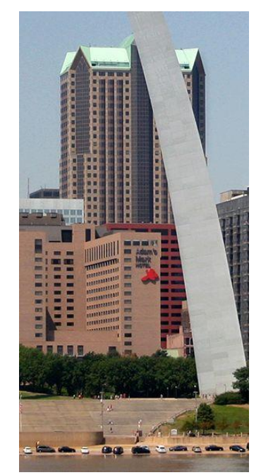
Metropolitan Square Building St. Louis, MO

The "Lights Out" portion of the program will encourage building managers to turn their "lights out" during the period of April 22 through mid-June 2020. The Gateway Arch, St. Louis Zoo, Missouri Botanical Gardens, Saint Louis Science Center and a growing number of businesses and institutions are planning to participate.